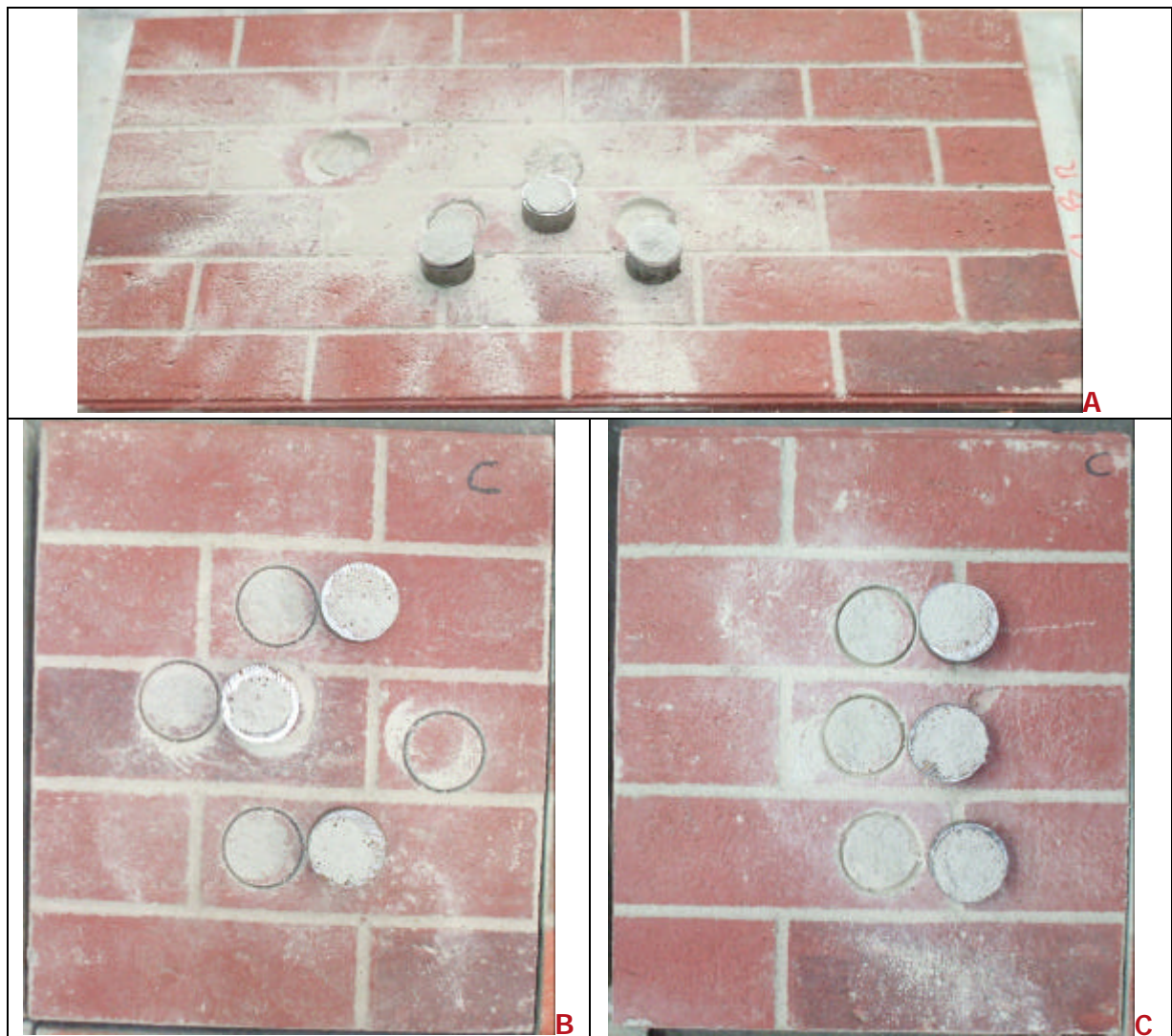
Pull Off Figures A – Control, B – After Hygrothermal Exposure, C – After Freeze/Thaw Exposure