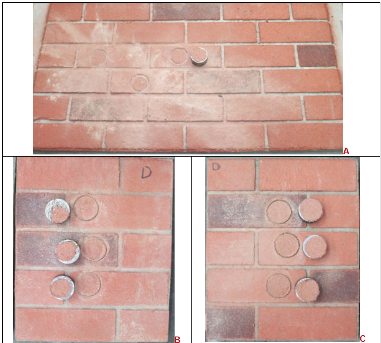
Pull Off Figures A – Control, B – After Hygrothermal Exposure, C – After Freeze/Thaw Exposure