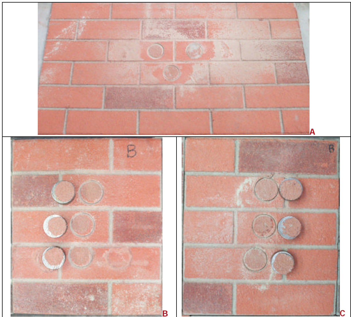
Pull Off Figures A – Control, B – After Hygrothermal Exposure, C – After Freeze/Thaw Exposure