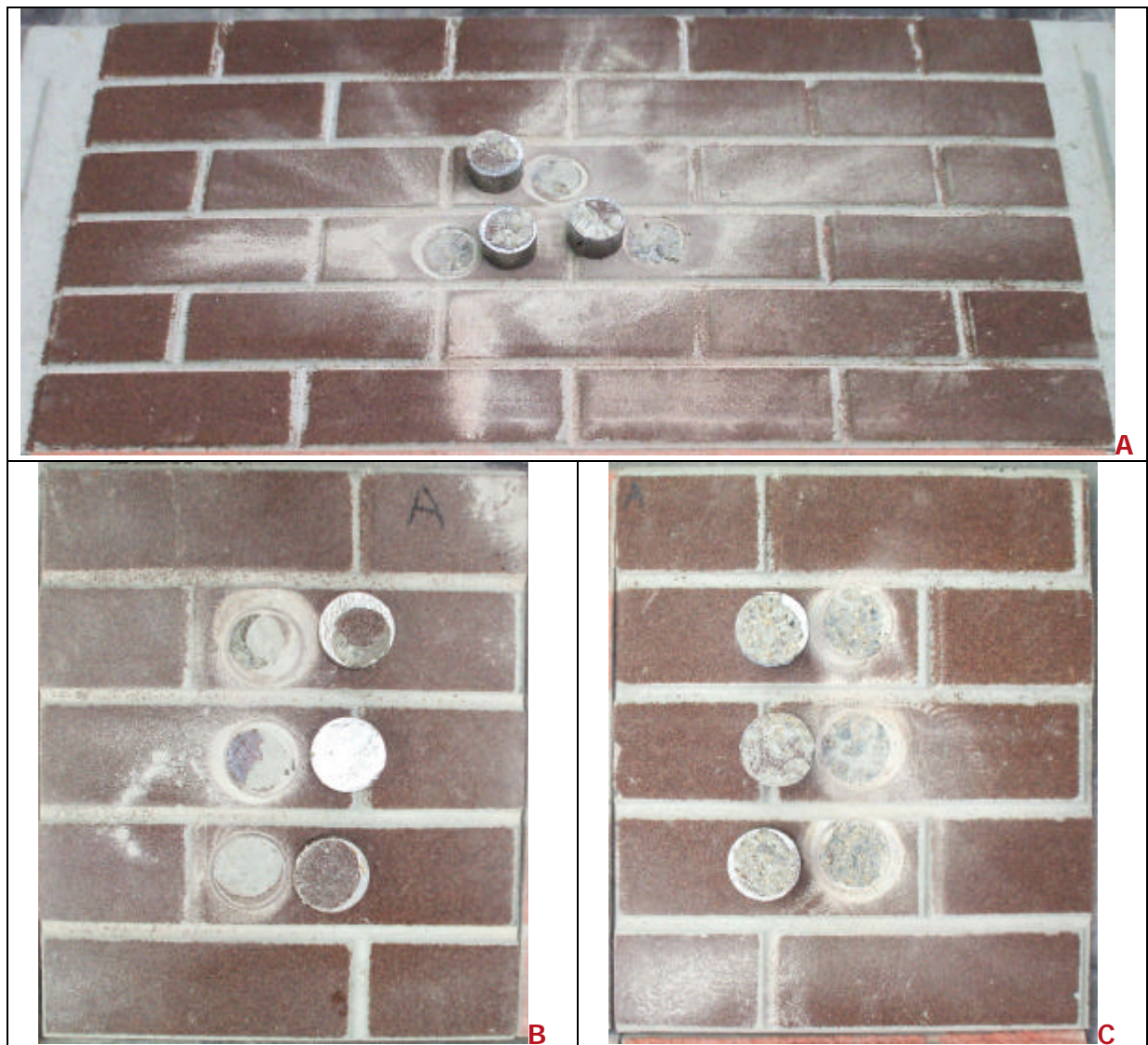
Pull Off Figures A – Control, B – After Hygrothermal Exposure, C – After Freeze/Thaw Exposure